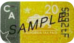
NEW Technology Tax Stamp, California