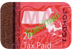
NEW Technology Tax Stamp, Massachusetts

The STATE System contains data synthesized from state-level statutory laws. It does not contain state-level regulations; measures implemented by counties, cities, or other localities; opinions of Attorneys General; or relevant case law decisions for tobacco control topics other than preemption; all of which may vary significantly from the laws reported in the database, fact sheets, and publications.